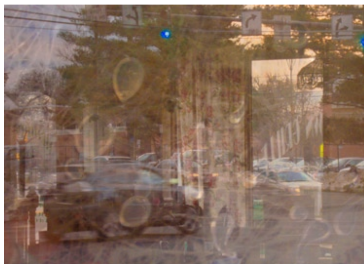
Kristy Simmons, Old Georgetown Road , 2011, photo-based art, 18 x 24 in, courtesy of the artist.

views of trees, directional signs, streetlights, cars, curtains, and their spectral reflections, all bathed in a sunset glow, fuse the natural and the manufactured