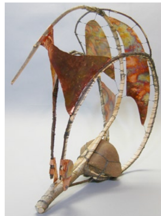
Marcos Smyth, Petranome , 2011, wood, copper sheet, stone, steel wire, and steel screws, 16 x 17 x 8 in, courtesy of the artist.

The origin of Marcos Smyth’s sculptures harkens back to his childhood in Brazil: “As a toddler, the sheer beauty of beetles and details of leaves or small plants captivated my imagination. . . my friends and I made many of our toys out of tin cans, wood, and discarded materials.” In his current artistic endeavors, Smyth combines his love for recycling with more recently acquired skills in metalwork and jewelry. Achieving a particular gesture guides experimentation and process. Other than the store-bought copper sheeting and steel wire, he uses driftwood and stones