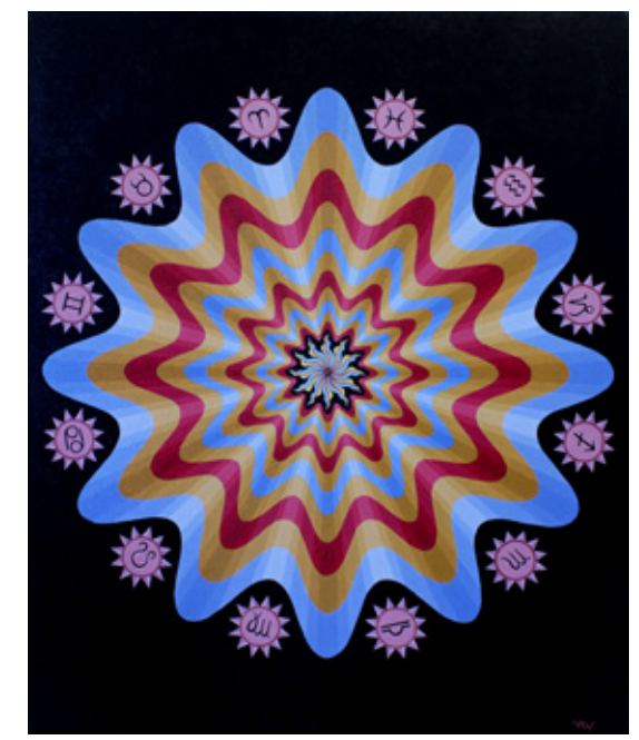
Victor R. Weidner, Supernova, 2002, oil on canvas, 24 x 20"; courtesy of the artist.

▲ Jeidner's early work, Methuselah Tree, features a fanciful mountain V scape with jutting diagonals of craggy outcrops and fractal-like branches of a lone tree and nearby bushes. Some twenty years later, Burnside Bridge, a panorama based on the three photos taken from the lower left foreground, evidences the index of refraction (a dimensionless number that gauges the bending of light as it passes from one medium to another) in the darkening bands of blue from the sky's reflections on the river. In 3D Vase, a dazzling still life from the same period, Weidner combines the purely abstract patterns of an hourglass vase and receding shelf with a bouquet of flowers. Equally eye-popping are his Concept paintings. In Supernova , for example, the illusion of an expanding wavy cone, achieved through shading, counters the flat, interior pinwheel and zodiac disks ringing its border.